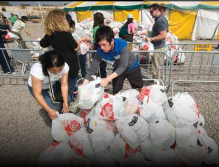
Volunteers from around the world prepare bags of groceries for distribution.