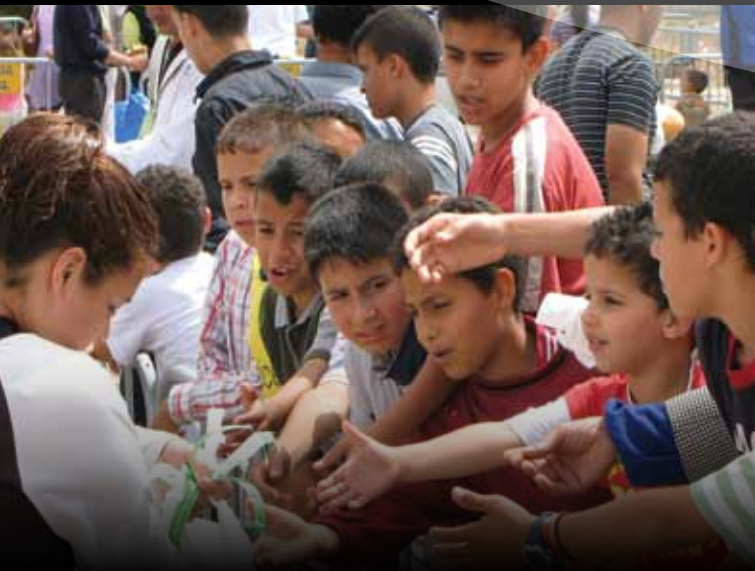
Honored guests received a free lunch, haircuts, groceries and services during the outreach.